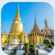
Grand Palace & Wat Phra Kaew