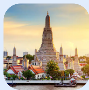
Wat Arun (Temple of Dawn)