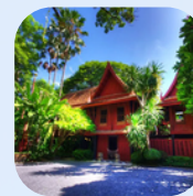
Jim Thompson's House