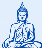
Spirituality and Buddhism