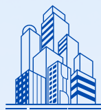
Modern Urban Oasis