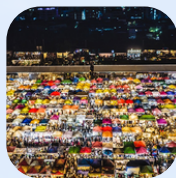
Chatuchak Weekend Market